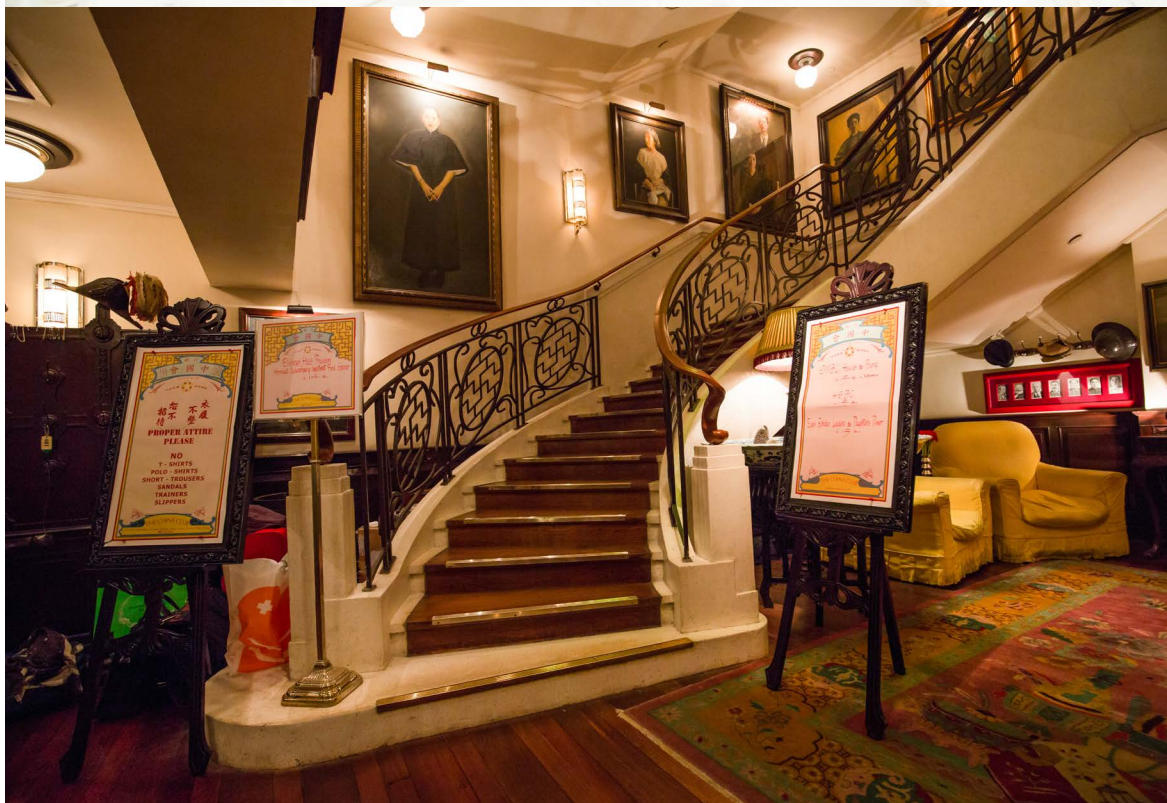
The China Club, The Old Bank of China Building, Hong Kong